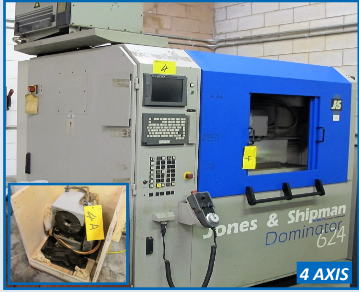
JONES & SHIPMAN DOMINATOR 624 CNC CREEP FEED GRINDER

2624 Royal Windsor Dr., Unit #3, Mississauga, ON