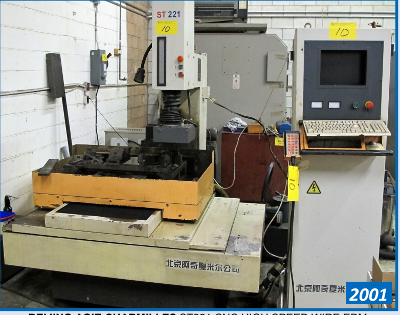
BEIJING AGIE CHARMILLES ST221 CNC HIGH SPEED WIRE EDM

Online Auction Only: Bidding Closes Tuesday January 15<sup>th</sup>, 11:00AM (ET)